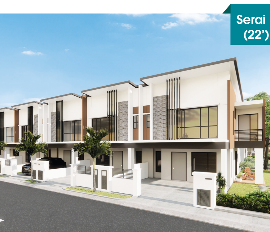
Serai 1 (22')