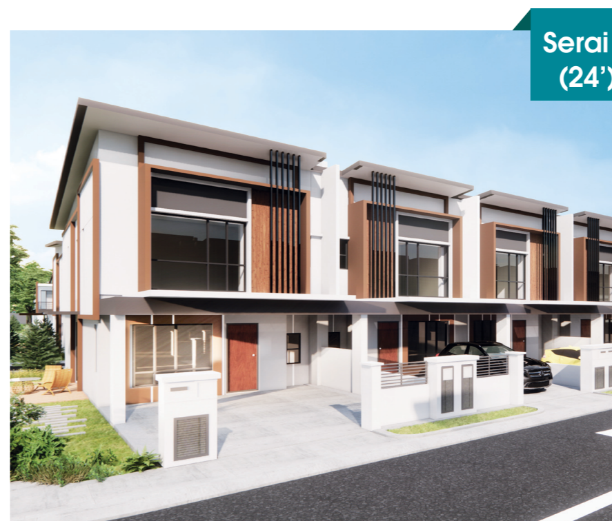
Serai 2 (24')