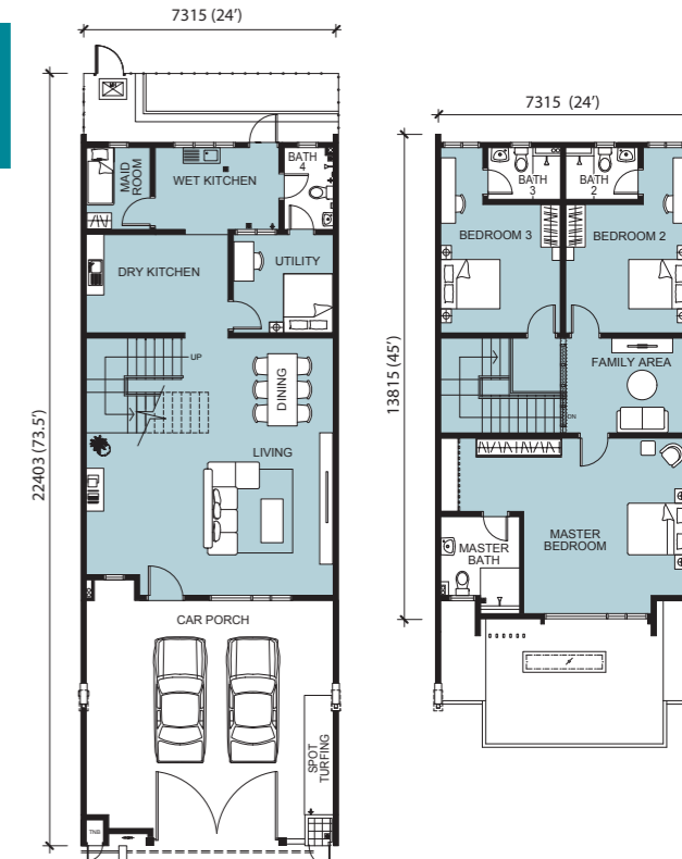
GROUND FLOOR 一楼